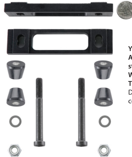
Yamaha YFZ450 Aftermarket steering stem adapter kit. Houser, Walsh Steering System. Thickness: 10mm Distance between the center of the holes 99mm.

Yamaha Raptor 700 Adapter kit Thickness: 23.5mm Apply semi-permanent thread locking fluid (Blue Loctite) when installing the adapter bolts.