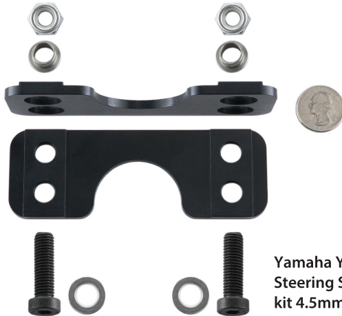
Yamaha YFZ450 Stock Steering Stem Adapter kit 4.5mm

If you purchased any of these kits for your ATV, install the kit onto your steering stem before installing the 720 Clamp System.